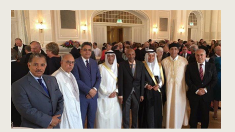
His Excellency was invited to the birthday celebrations of HRH the Grand Duke of Luxembourg .